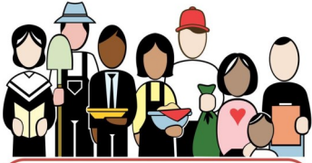
Reaching out to serve

There is an opportunity for Zion's congregation to continue outreach to those in need in our own community!